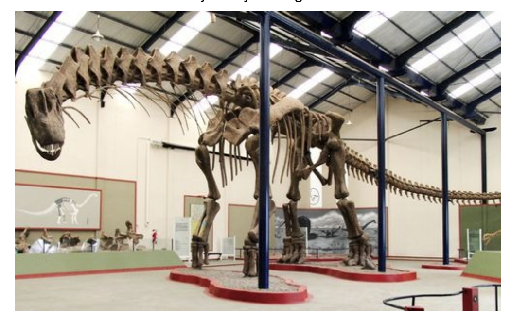
Museo Municipal Carmen Funes in Neuquén, Argentina

This is what the skeleton of the Argentinosaurus would have looked like!