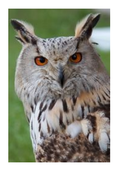
Great horned owls eat other owls.

Owls fly quietly. This helps them catch other animals. The animals can't hear the owls coming. Owls use their claws to grab the animals.