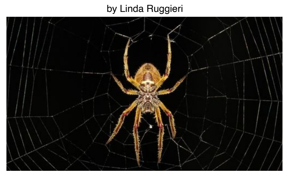
Anansi is a spider. He has eight legs. He makes a web. Here, a spider sits on its web.

This is a story told in Africa about Anansi, the clever spider.