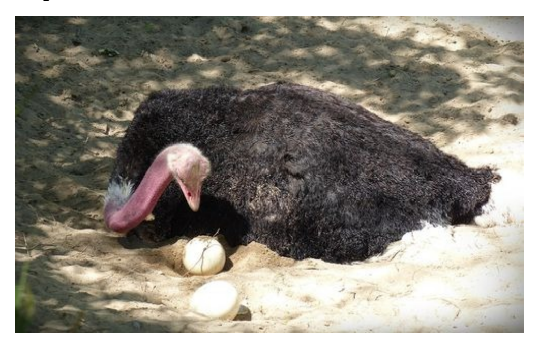
Ostriches lay the biggest bird eggs.

Birds lay eggs. Some eggs are pointy. Some eggs are round. Baby birds grow in the eggs. The babies come out of the eggs when they are big enough.