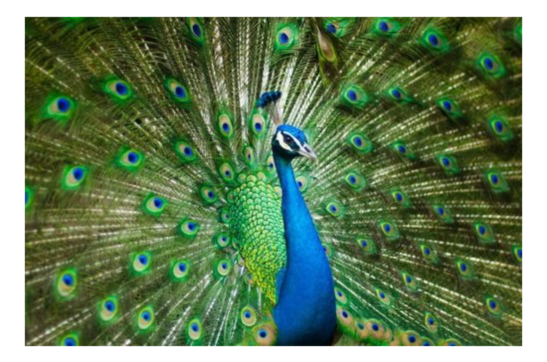
Peacocks have beautiful feathers.

Birds have beaks. Some birds have long beaks. Other birds have short beaks. Birds can use their beaks to help them eat.