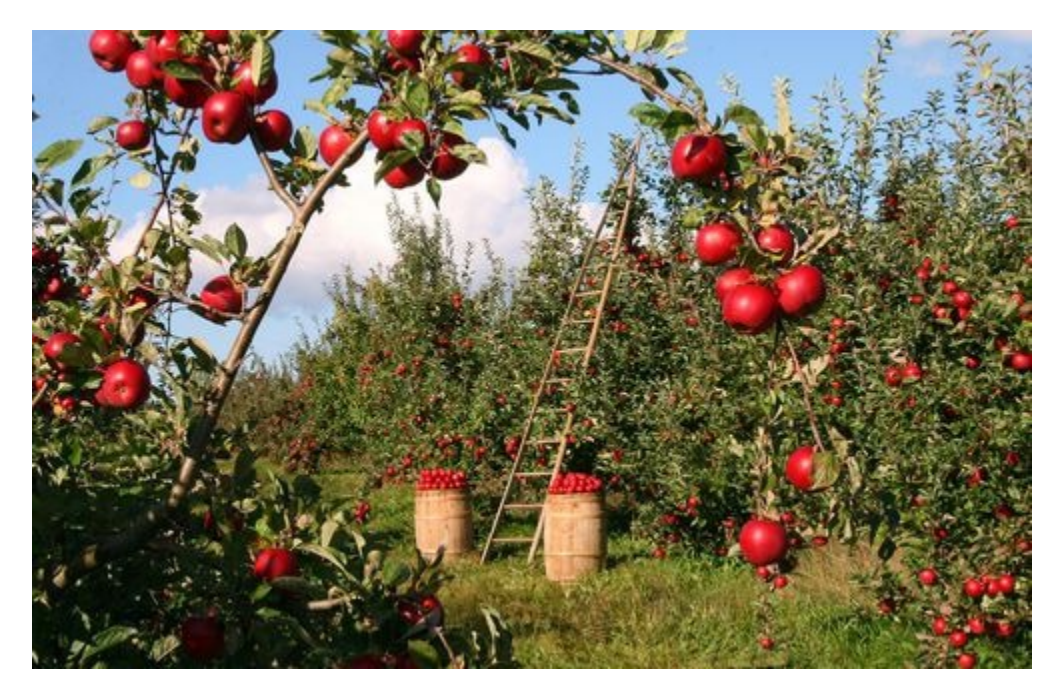
Farmers crow crops like apples.

Farmers grow crops for people to eat. Some insects eat these crops. Some birds eat these insects. This keeps the insects from eating our crops. Thanks, birds!